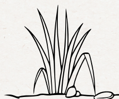
Reduces Available Desirable Grasses